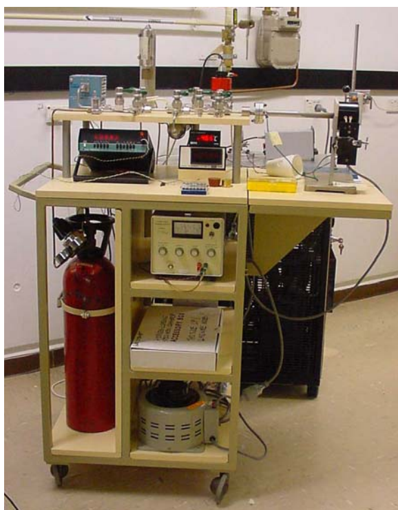
Hydrogen loading apparatus