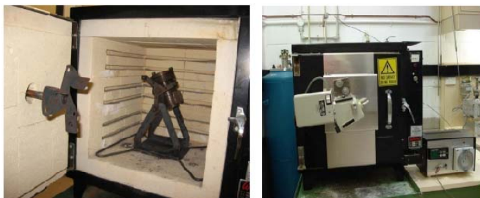
Rotating autoclave (hydrothermal reactions)