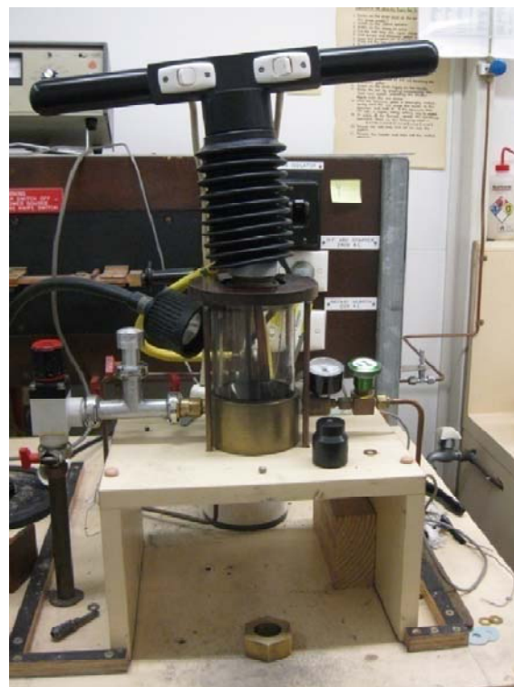
Argon arc furnace