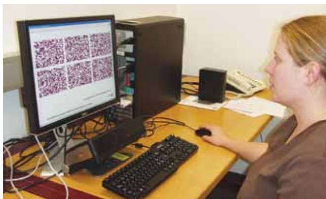
This image shows an introduction screen from the test instrument that we use to investigate visual cluster detection.